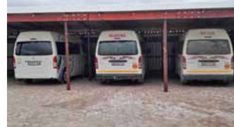
A NEW PARKING STRUCTURE FOR OUR VEHICLES!