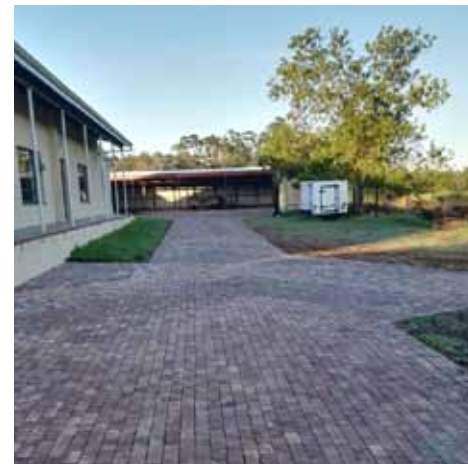
OUR NEW EXTENDED DRIVEWAY ALLOWS FOR US TO PICK UP AND DROP OFF CHILDREN WITHOUT MUDDY CONDITIONS—A VERY GOOD THING!