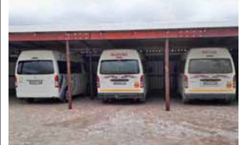
A NEW PARKING STRUCTURE FOR OUR VEHICLES!